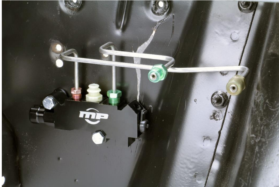
Figure 3 – Brake Line Routing