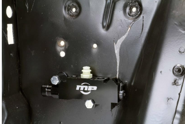
Figure 2 – Combination Valve Location