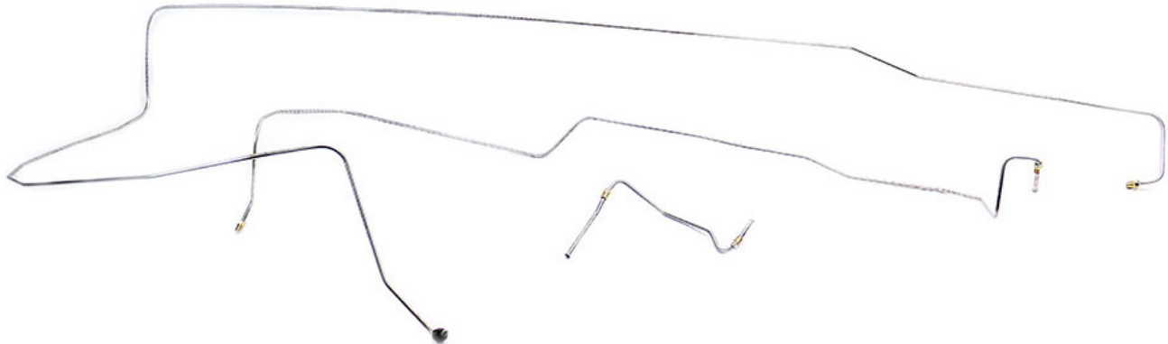
Complete Line Set Shown