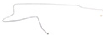
Front to Rear Line